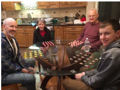
Many creative games are played during family gatherings. "Play Nine" is best.