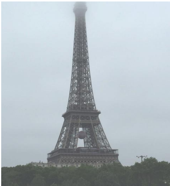
I forgot to count the number of steps.