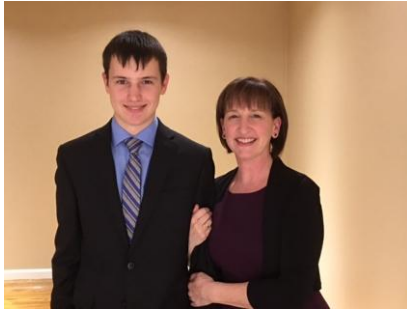
Children (and grandchildren) grow up too fast.