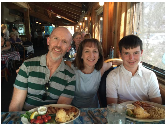
Also enjoy new restaurant in Morgan Hill