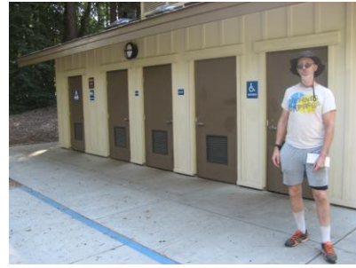
Mount Madonna County Campgrounds has clean hot showers.