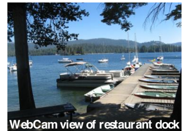
WebCam view of restaurant dock