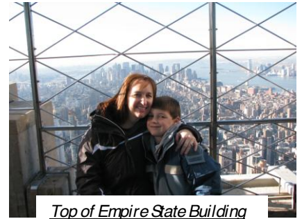
Top of Empire State Building