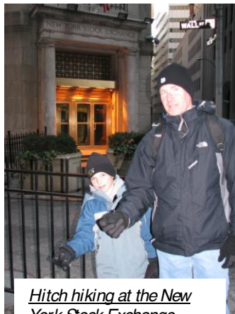
Hitch hiking at the New York Stock Exchange