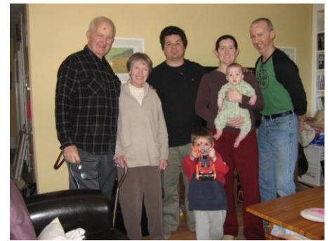
Visiting with Lipseys in El Segundo

We wish everyone the very best during the current difficult economy and hope that all will survive with as little damaging consequences as possible.