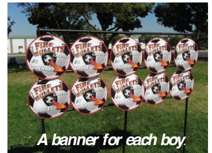
A banner for each boy