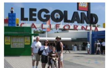
Perhaps last trip to Legoland?