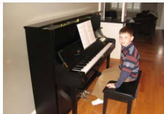
Finally a real piano in 2009

many more years before he looks at her at eye level. He enjoyed his third camping and sailing trip but expressed